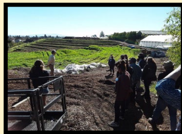
Applied regenerative agriculture best practices