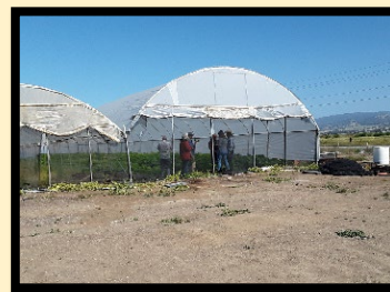
Production, distribution, and marketing of high-value crops